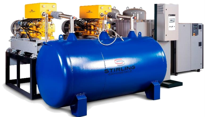
StirLIN-4 (Extendible) & StirLIN-8

Stirling Cryogenics is a registered trade name of DH Industries BV