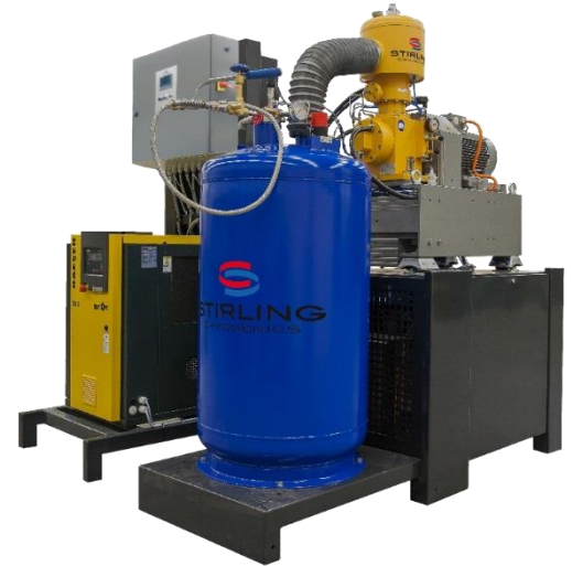
StirLIN-1 Lite, Economy & Compact