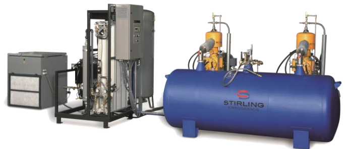
StirLIN-1 Extendible & StirLIN-2